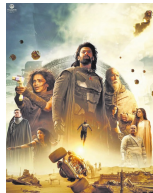
Kalki features Amitabh Bachchan and Kamal Haasan